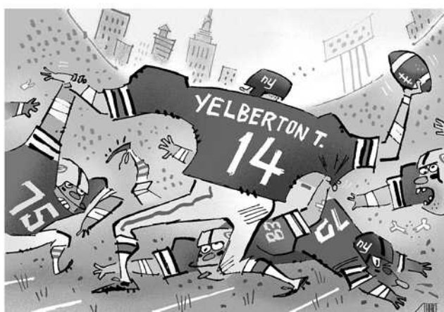
BOB STAAKE FOR THE WASHINGTON POST

Week 1220, pedantry: The singular form of "cannoli" is "cannolo." The reason for the